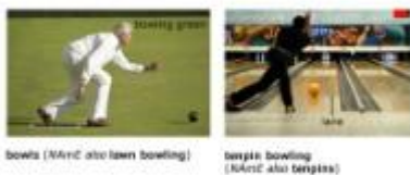
bowls (NAmE also lawn bowling) beryn bowling (NAmE also beryn)

bowl [bɒl bɒlz bɒld bɒlɪŋ] noun, verb BrE [bɒl] ⓘ NAmE [boʊl] ⓘ noun