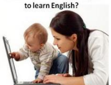
The sooner the better!